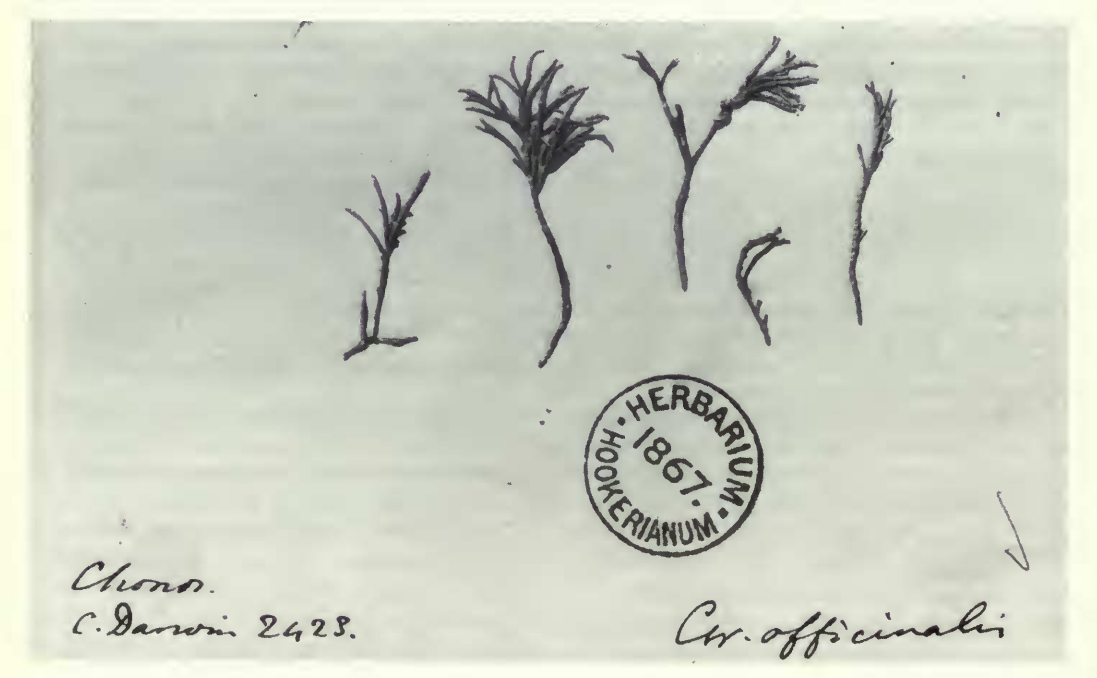
Fig. 5 Darwin 2423, specimens of Corallina officinalis L. from the Archipielago de los Chonos, Chile, collected either in December 1834 or January 1835.

The second is a syntype of Amphiroa orbigniana Decaisne ex Harvey, with Darwin 1770 as another